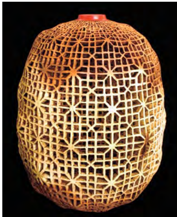
LATTICE IN THE CLOUDS II, MESQUITE WOOD, OIL, ACRYLIC, 10 X 8 X 8"