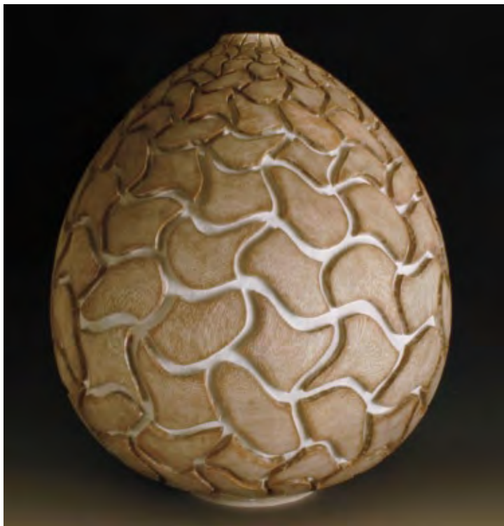
TESSERAE, FICUS WOOD, PAINT, 12 X 10½ X 10½"