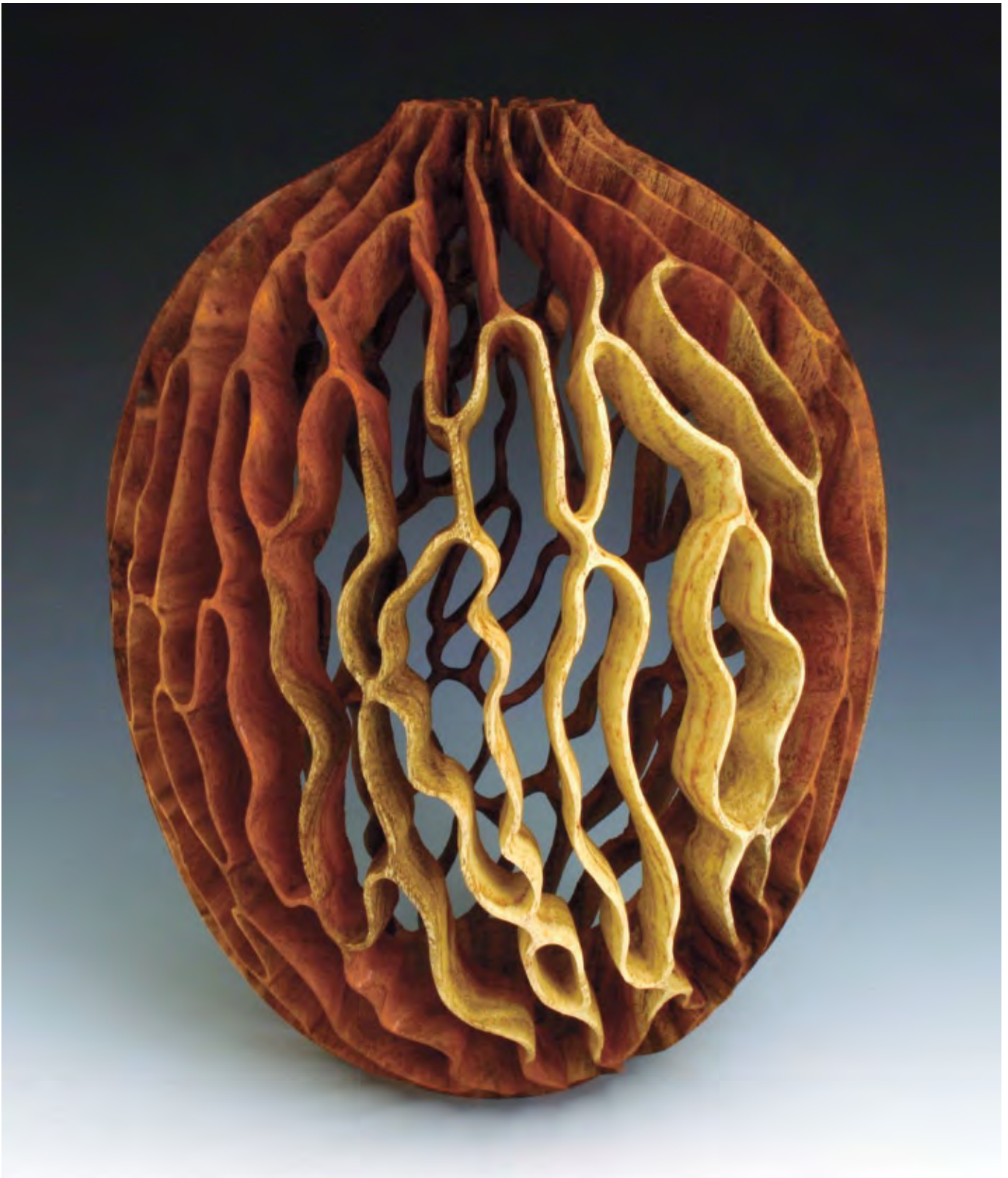
TRANSITIONS, CAROB WOOD, 9 x 7"